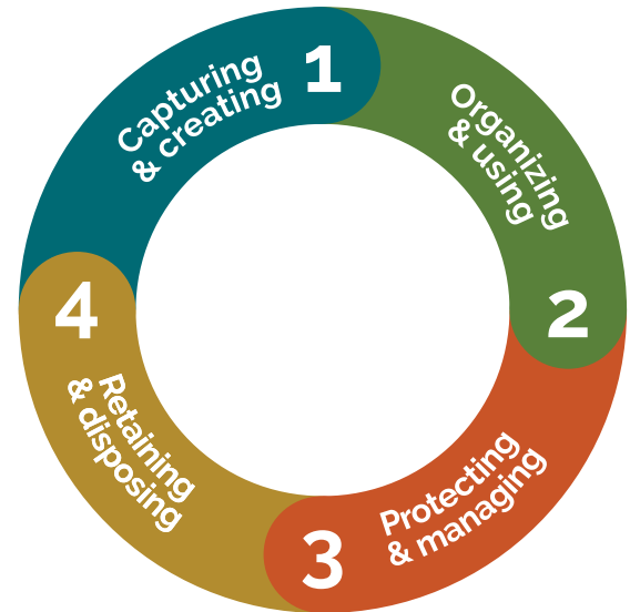
Figure 1: The recordkeeping life cycle

During the period under audit, the Archives received an annual budget of approximately $2.7 million, including $700,000 from the Hudson's Bay Company Foundation to pay for archival staff caring for the HBC Archives. The majority of the expenses in 2022/23 (87%) were for staff salaries and benefits for nearly 38 full-time equivalents (FTEs). The balance of the funding was for other operational expenses such as materials, supplies, and equipment. The Archives recovered 13% of its expenses from departments for costs related to records storage, and from Special Operating Agencies and agencies for record storage, retrieval, and destruction.